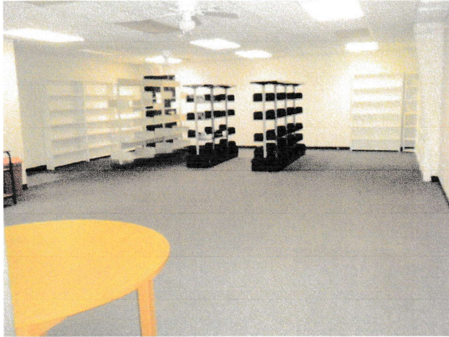
Photo to the left: A picture of most of the old library after we moved the books. It was small, much darker than the picture shows, and it didn't have a great selection of materials for checkout.