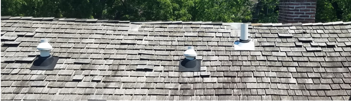
East Building showing deteriorated wood shingles.