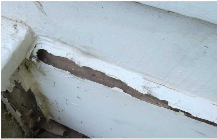
Peeling paint at building base conditions