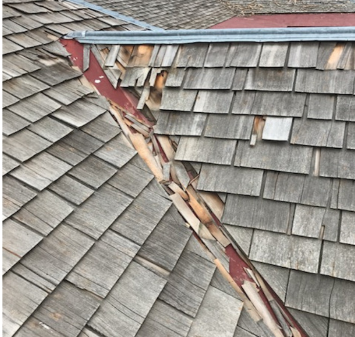
Golf ball size hail damages