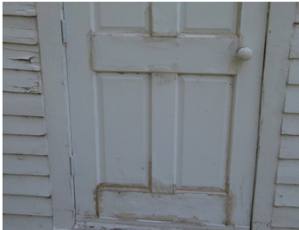
Exterior doors requiring preservation work