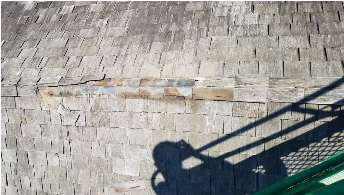
Ridge shingle damages