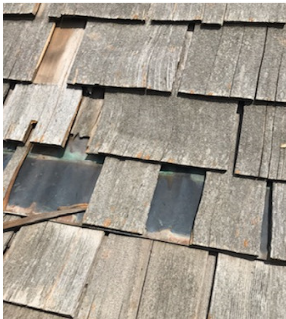
Golf ball size hail damages -detail of typical conditions