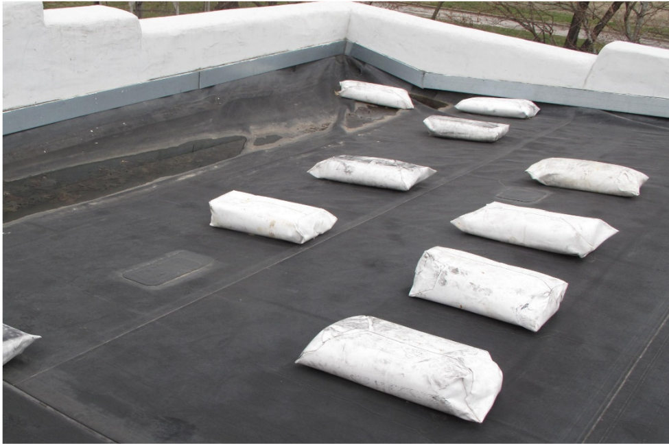
Damaged roof with temporary patching and ballast bags