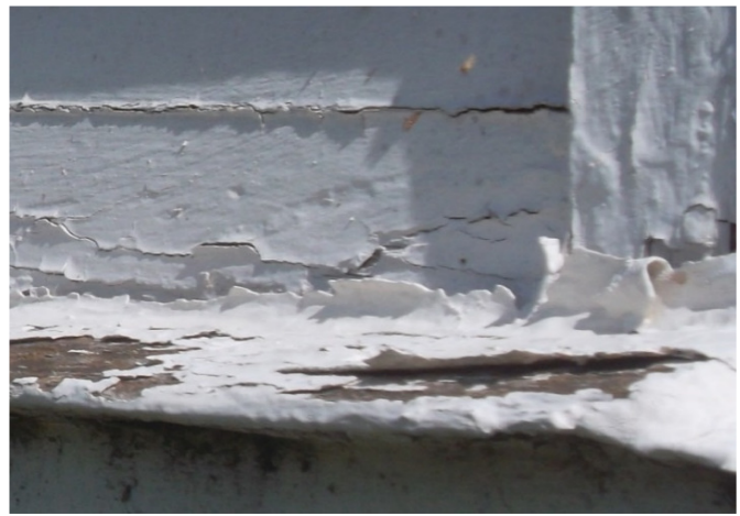
Peeling paint issues of wood trim