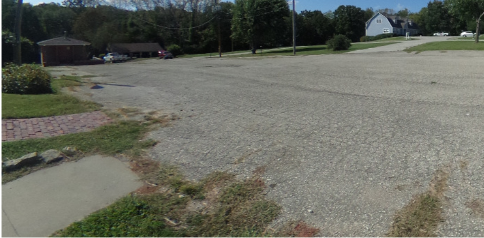
ADA parking area at bottom of ramp