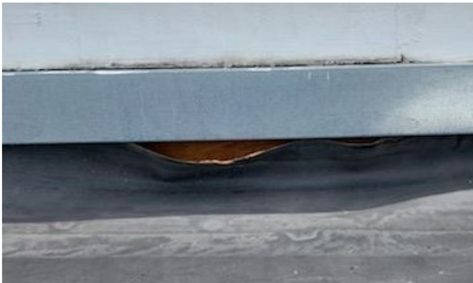
Damaged roof with membrane pulling away from counter flashing