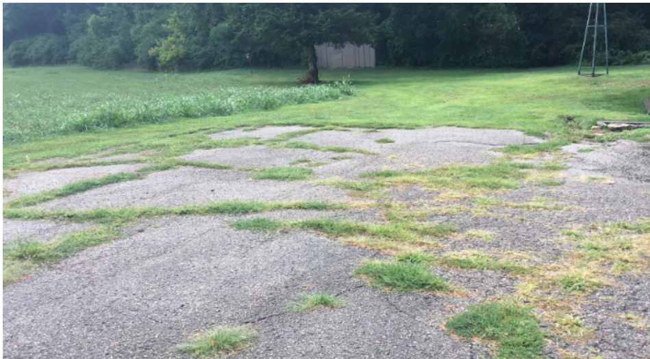
Parking field is end of life requiring replacement