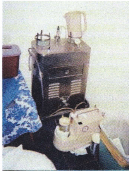
Unsterile surgical bedside with open trash and dirty carpet