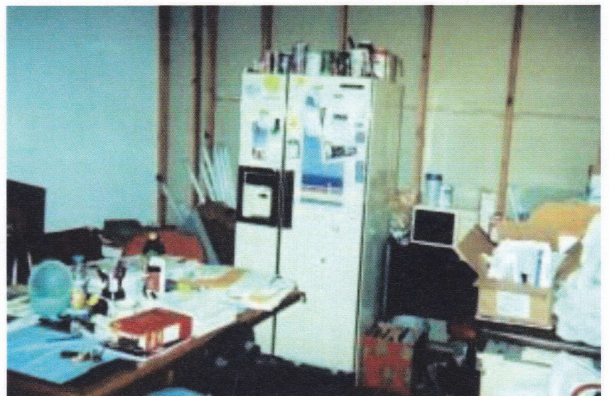
Combination lunch room/drug prep/aborted fetus storage/patient files