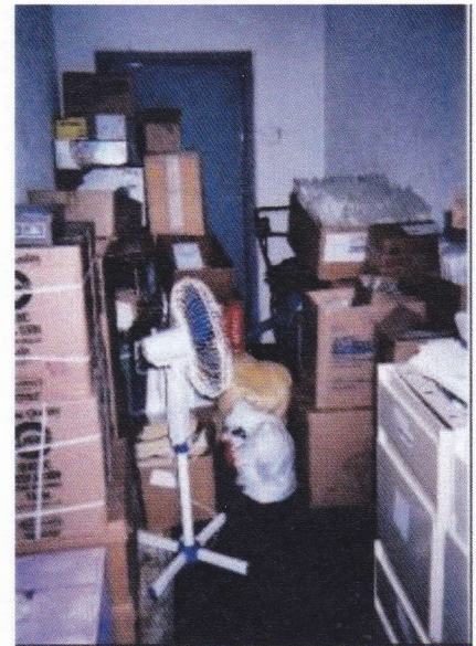
Fire hazard blocked back exit with lawn mower as a "back-up generator"