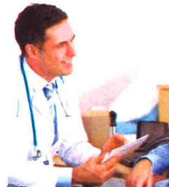
Click For Doctor's Letter Airlines & Housing