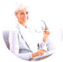
Step 2: 15-Minute Licensed Mental Health Professional Online Consultation