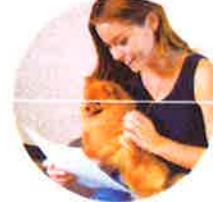
Step 3: Receive Your ESA Letter