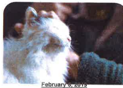
February 6, 2019

Dogs are incredibly smart animals. In fact, the average pooch can understand about 165 words, with the smartest dogs learning well over 200. This intelligence is what