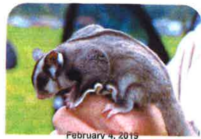
February 4, 2019

Ever since dogs were first domesticated by humans, they have served as great companions animals. They help humans bust