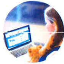
Step 1: Free 5-Minute Online Pre-Screening