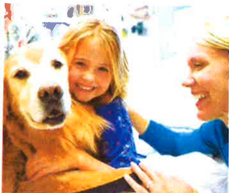
Emotional Support Animal Click Here to Register

Register Your Service Animal, Emotional Support Animal, or Apply for a Letter from a Licensed Mental Health Professional Travel & Housing.