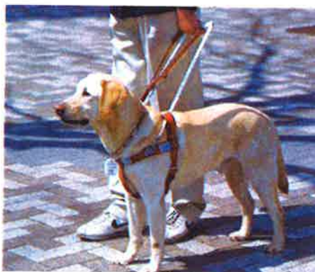
Service Animal Click Here to Register