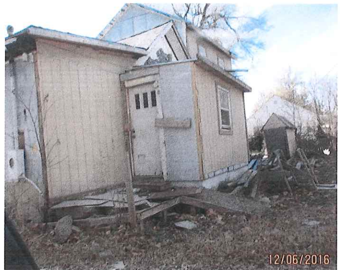
Vacant for 5 Years