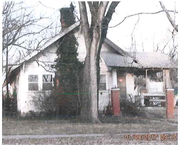
Vacant for 10 Years