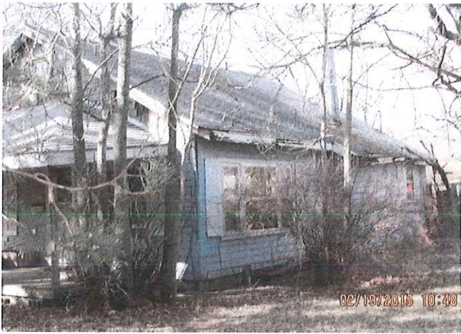
Vacant for 10 Years