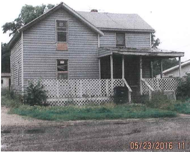
Vacant for 1 Year