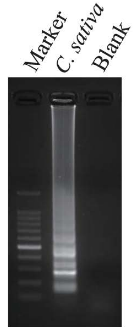
Marker: 100 bp ladder