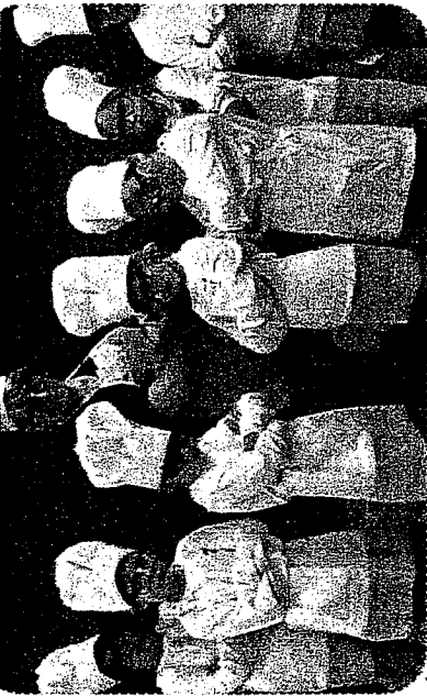
The iPad Chefs

You've heard of the Iron Chefs, these 3rd and 4th graders are known as the iPad Chefs. These young chefs create content by utilizing apps on the iPads. They were the keynote speakers at the KU Learning Conference in 2012, and have taught nearly 1000 Kansas educators about utilizing the iPad in the classroom. These students are cooking up engaging learning opportunities that make school