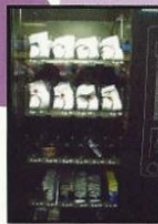
Sock Vending Machine