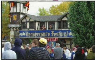
We love the Renaissance Festival - Fall in Bonner Springs, KS.