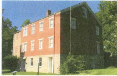
The Iowa and Sac & Fox Mission Museum