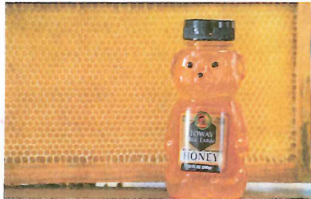
Freshly bottled honey and honeycomb to harvest