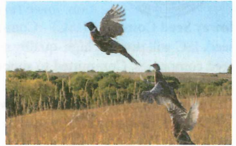
Recent release of game birds at the national park