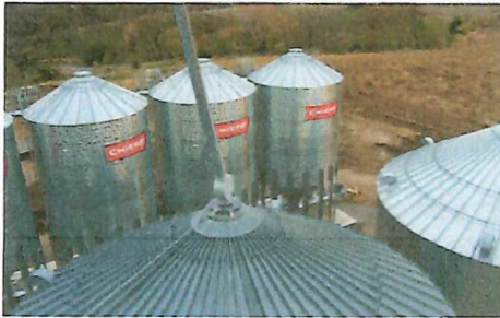
Site of the future Ioway Seed Company

Center of Excellence in Regenerative Native Agriculture (CERNA) - CERNA will become a national center of education for regenerative agriculture. Students will enjoy multi-classroom and in-field training where they'll learn about the newest smart farm technologies and best practices for regenerative agriculture. Using precision agriculture and current market business trends will ensure we create the next generation of regenerative farmers utilizing the best of class technologies. The center is supported by a diverse group of partners including: John Deere, Understanding Ag, Terramera, Cooks Ventures, Proximity Malt, Central Soyfoods, and many others.