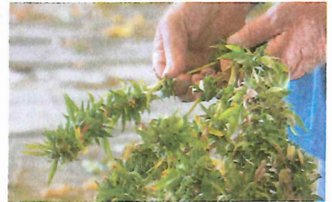
Hemp flower being removed from the stalks

Soje and Hemp Farm - We were the 4th tribe in the nation to receive a USDA industrial hemp license. We grow and sell SOJE , a Native American hemp cigarette featuring traditional native smoking herbs and regeneratively produced hemp flower. SOJE.co