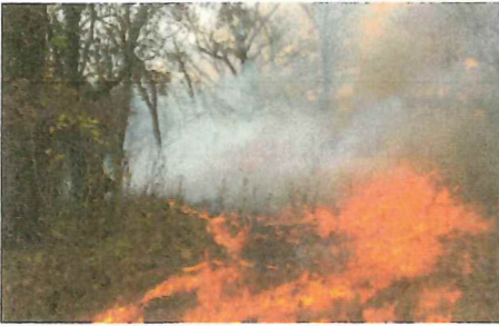
Traditional fire practices in use at the national park

Established in 2020, the Ioway Tribal National Park was the second tribal national park to be established and is the largest tribal national park in the nation. The national park includes conservation land, tribal land, and places of cultural and historical importance to the Ioway people and our community, including the newly acquired Iowa and Sac & Fox Mission. While currently only open to tribal members, the Ioway Tribal National Park will generate more interest in the reservation and support our ecotourism and agrotourism efforts in the future. We plan to establish an eagle aviary and wildlife rehabilitation program at the ITNP. Finally, the INTP will support our river health and Land Back efforts.