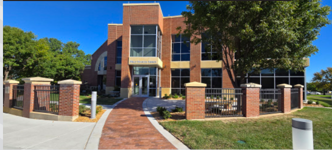
MARCUS WELCOME CENTER