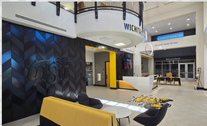
SHOCKER SUCCESS CENTER