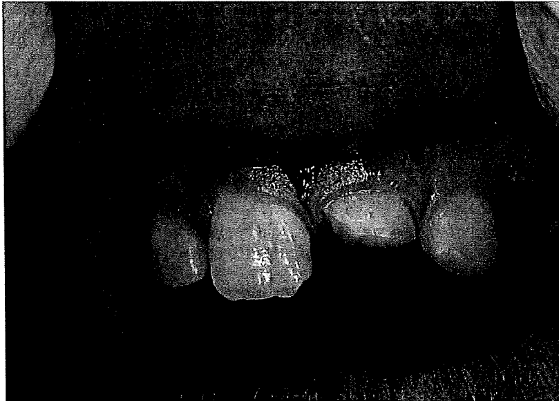
Figure 1 healing 2 weeks

Johnny (alias) went to school doing the normal things kids do during playtime. During recess, his parents get the emergency call that activities got too active and in all the fun, Johnny managed to fracture 3 teeth. Fractures occurred from a mild enamel fracture all the way up the scale to an advanced fracture involving the nerve. Multiple appointments were needed to treat the damage.