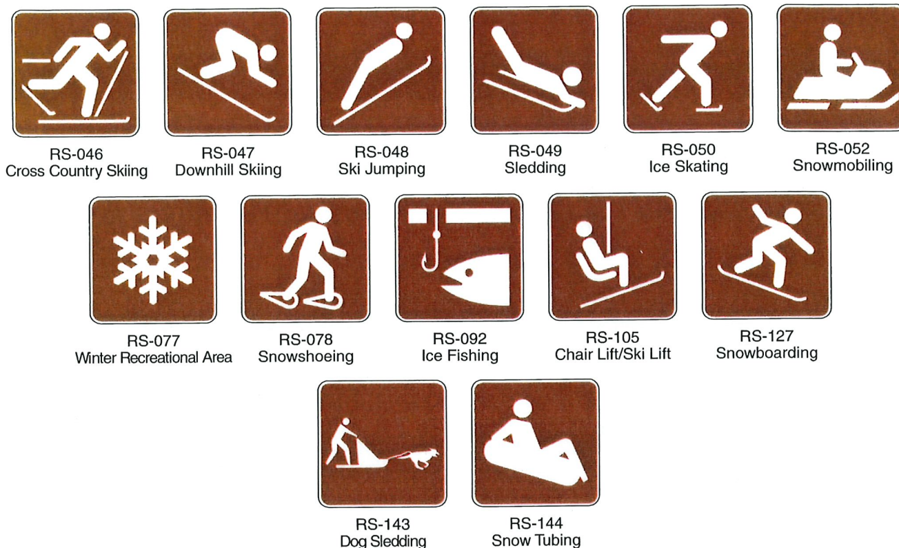
Figure 2M-10. Recreational and Cultural Interest Area Symbol Signs for Winter Recreation