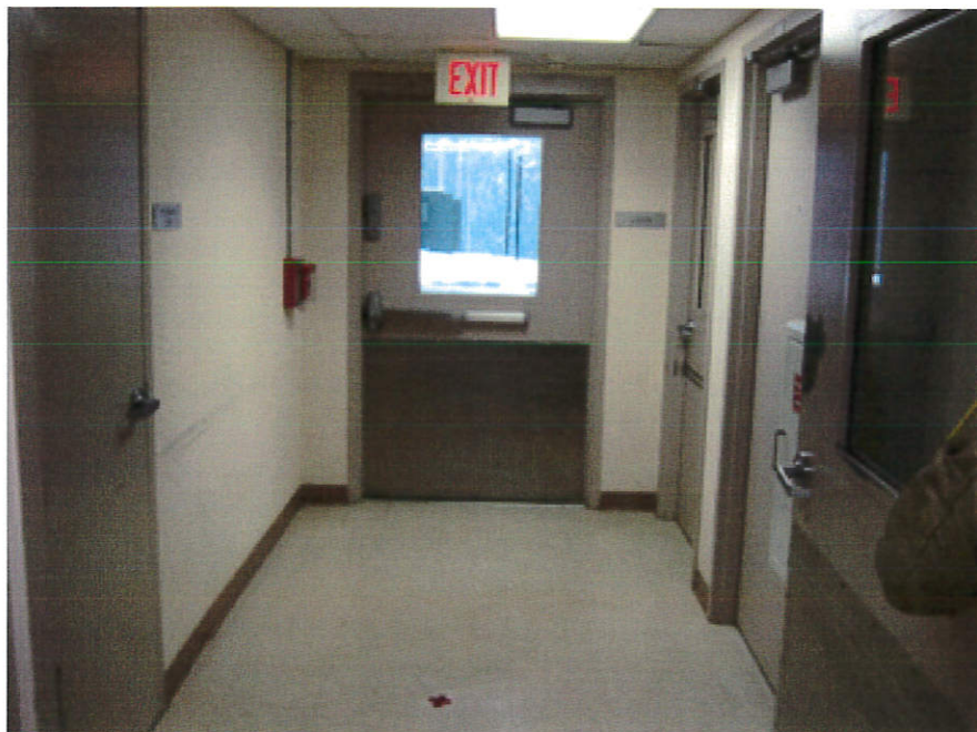
Exhibit F – Hallway Elevator Entrance Blind Spot (Camera Located Around Corner to the Right)