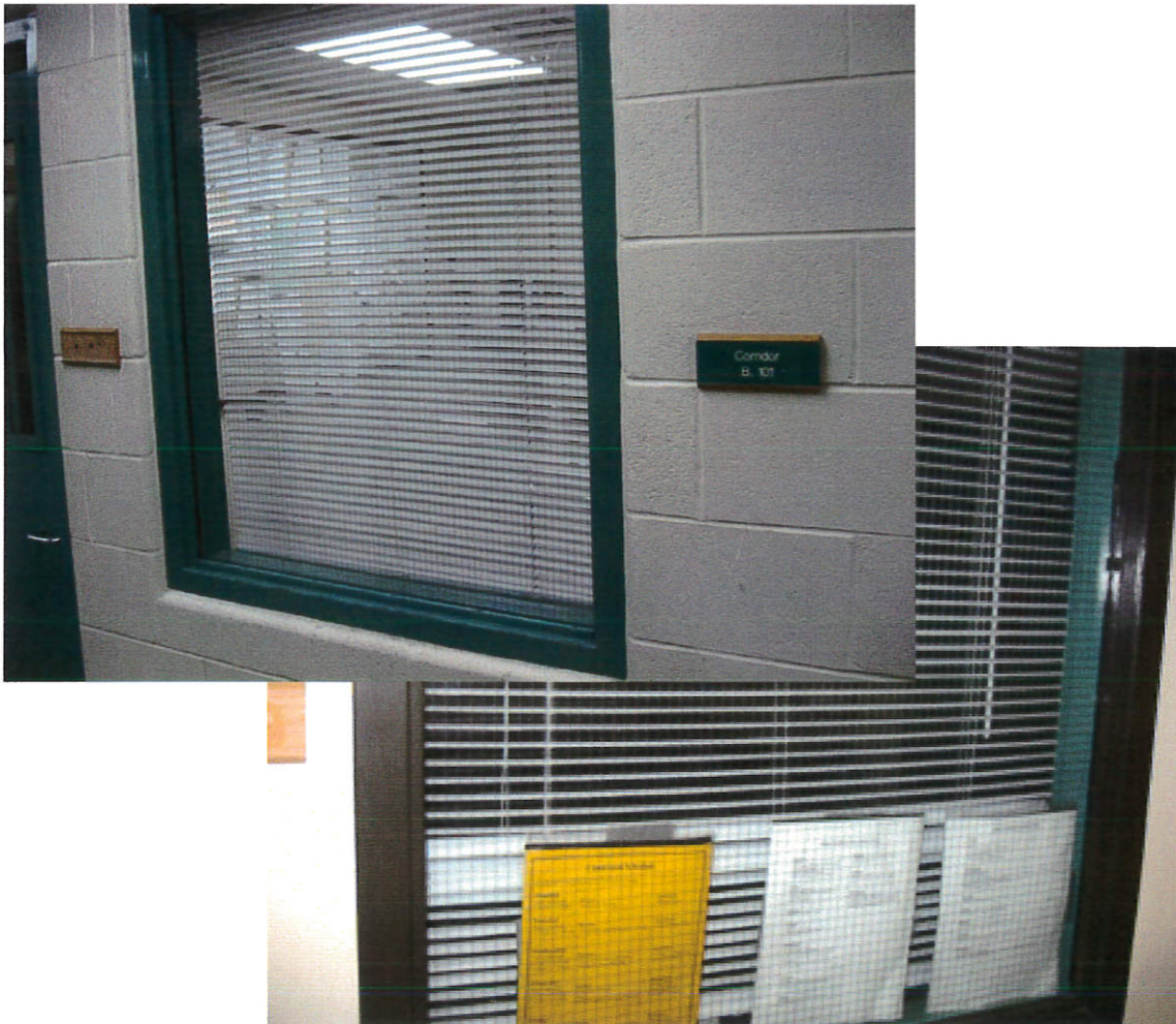
Exhibit G – Office Blinds in I Building (top left) and Program Office Blinds (bottom right)

Monitoring of activity would also be facilitated by removal of blinds and other obstructions that limit viewing of activities in offices and enclosed program areas (see Exhibit G).