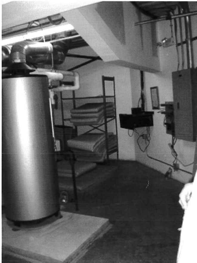
Exhibit H – Mechanical Area

The facility also has a number of closets, mechanical rooms and other enclosed spaces that could be used for inappropriate activity (see Exhibits H and I).