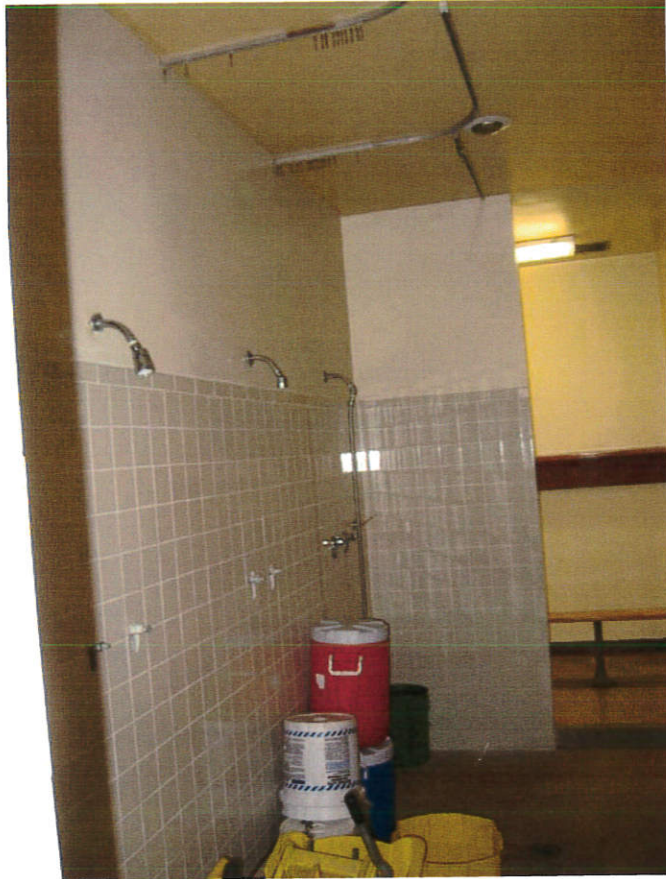
Exhibit D – Obsolete Showers Adjacent to Recreation Room/Gymnasium (No Camera Present)