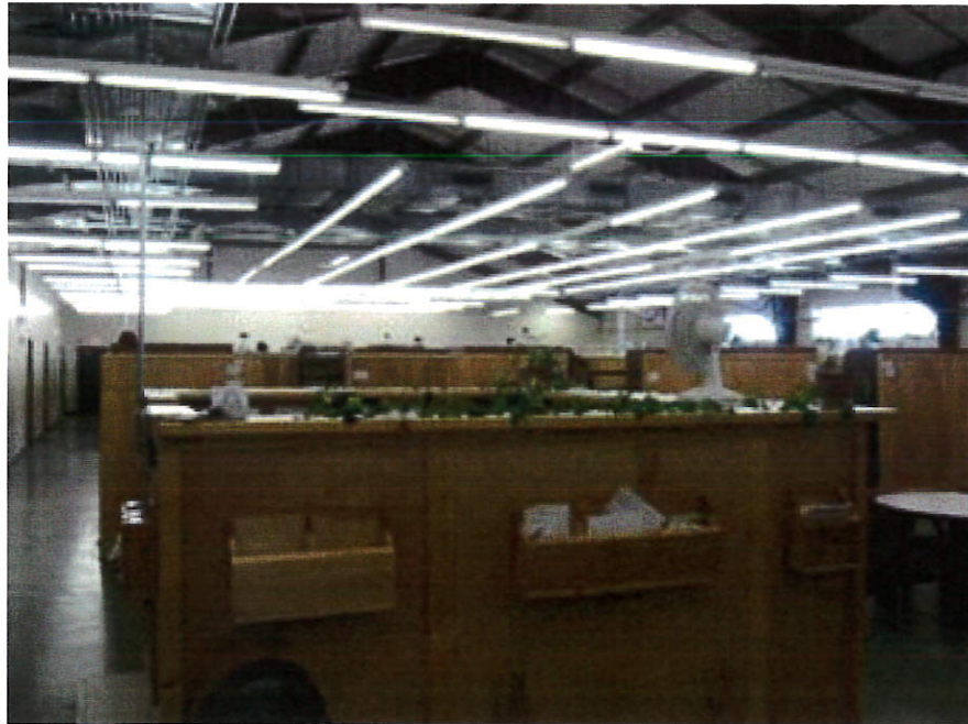
Exhibit C – G Housing Unit Officer's Desk

The size of these partitions made it virtually impossible for staff to see out into the living units unless they were standing. Officers were forced to rely on video cameras to see into the units and down the hallways. The video feed from multiple cameras is often viewed on a single screen with small picture tiles. This can make monitoring of behavior challenging, and can diminish the level of inmate supervision. While cameras can be a useful management tool, adequate staffing to monitor key areas and provide inmate supervision is essential. Staffing will be addressed in the next section of this report.