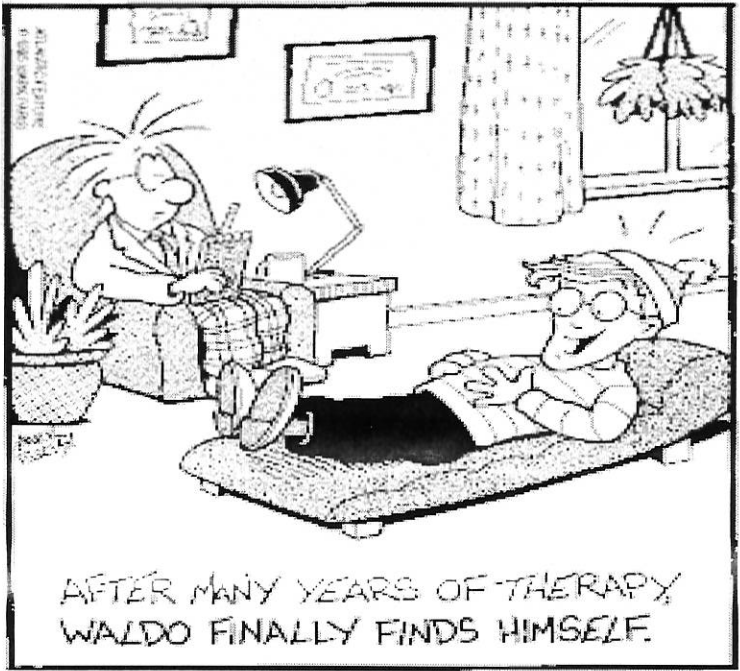
AFTER MANY YEARS OF THERAPY, WALDO FINALLY FINDS HIMSELF.