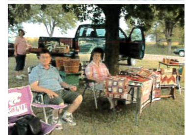
Top to bottom: T-Bones market, peppers and produce at Manhattan market, and vendors at Smith Center market.