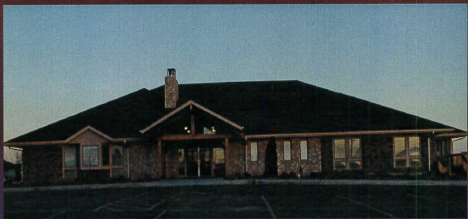
PBP Elder Center