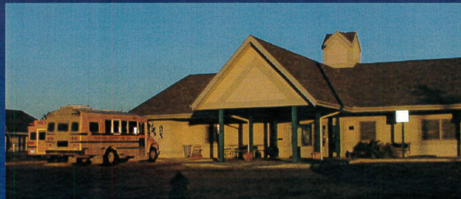
Day Care Center