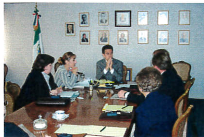
Meeting with Flour Millers Federation official in Mexico City