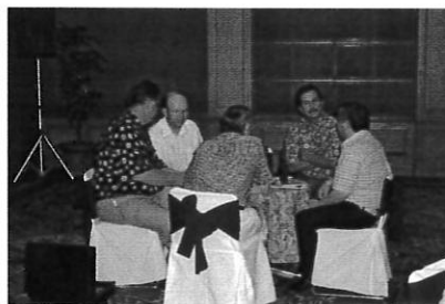
21 st Century Bean Processing Coop. and perspective buyer at mission reception.