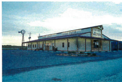
Yoder Meats/Kansas Station Retail Facility