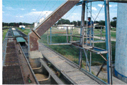
Loading of IP wheat at Harper Coop.