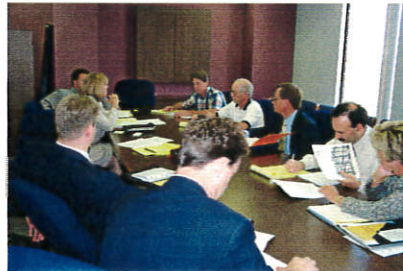
Meeting with Valley Vegetable producers and KDOC&H Agriculture, Business Development, and Community Development staff