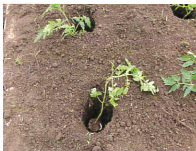
Tomato plants potted with CVR pot.