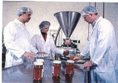
KSU Food Science Pilot Plant