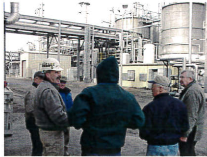
Kansas producers visit an ethanol facility in Nebraska.