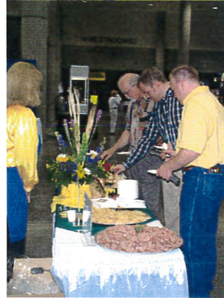
Buy Kansas First Buyers Reception