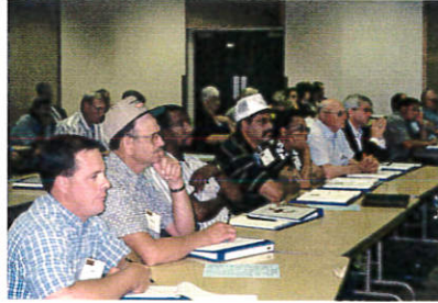
Producers at the 2000 Value Added Conference.