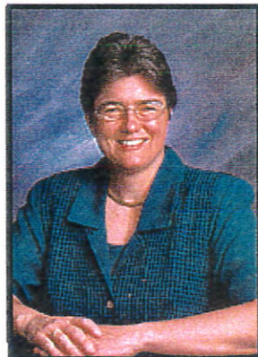
Sarah Pike Turner Middle School, Kansas City Turner USD 202