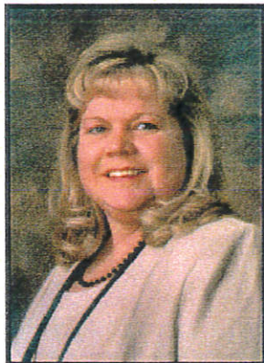
Linda McPherson Mize Elementary School, Shawnee DeSoto USD 232