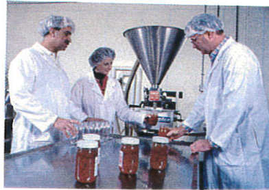
KSU Food Science Pilot Plant