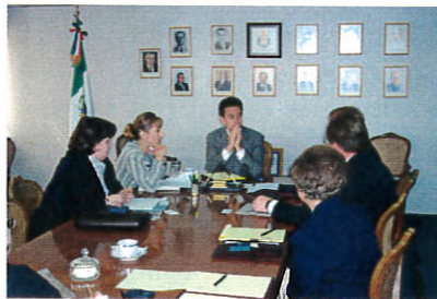
Meeting with Flour Millers Federation official in Mexico City