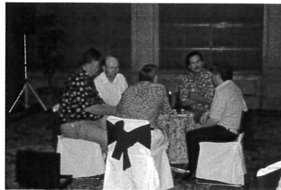
21 st Century Bean Processing Coop. and perspective buyer at mission reception.