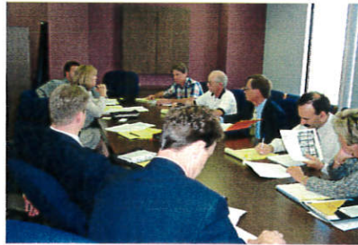
Meeting with Valley Vegetable producers and KDOC&H Agriculture, Business Development, and Community Development staff