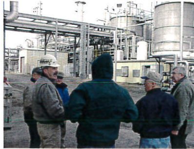
Kansas producers visit an ethanol facility in Nebraska.