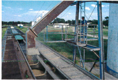
Loading of IP wheat at Harper Coop.