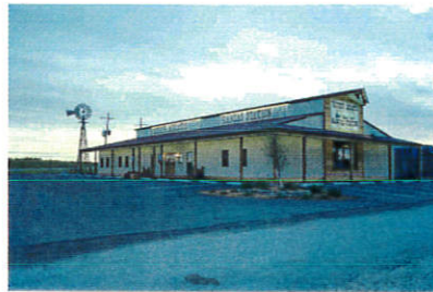
Yoder Meats/Kansas Station Retail Facility