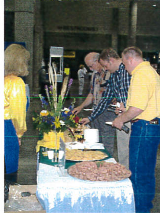
Buy Kansas First Buyers Reception