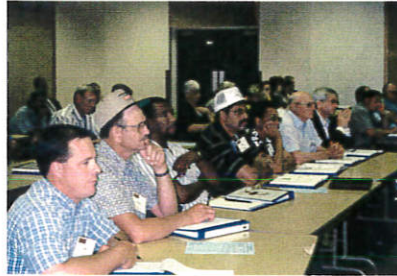
Producers at the 2000 Value Added Conference.