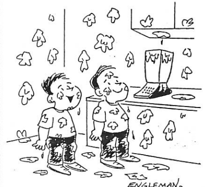
"Did you see that? The blender lid soared just like a frisbee!"

P.O. Box 5107, Sioux Falls, SD 57117, (605) 335-0143, Fax: (605) 331-0426 Leading Ag Electronics into the future //w3.iw.net/raven/