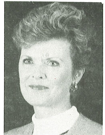
Lyn Baldwin Washburn Rural Middle School, Topeka USD 437