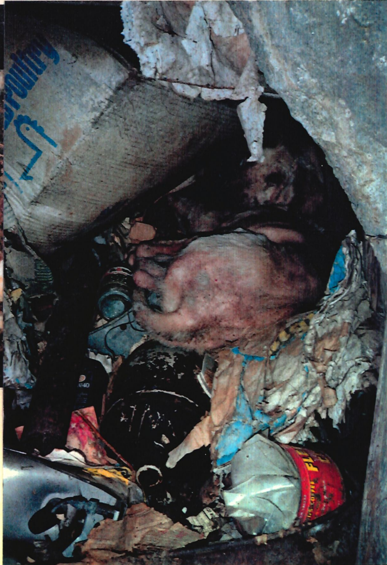
Dog found in shed. Found next day dead. Mange, parvo.