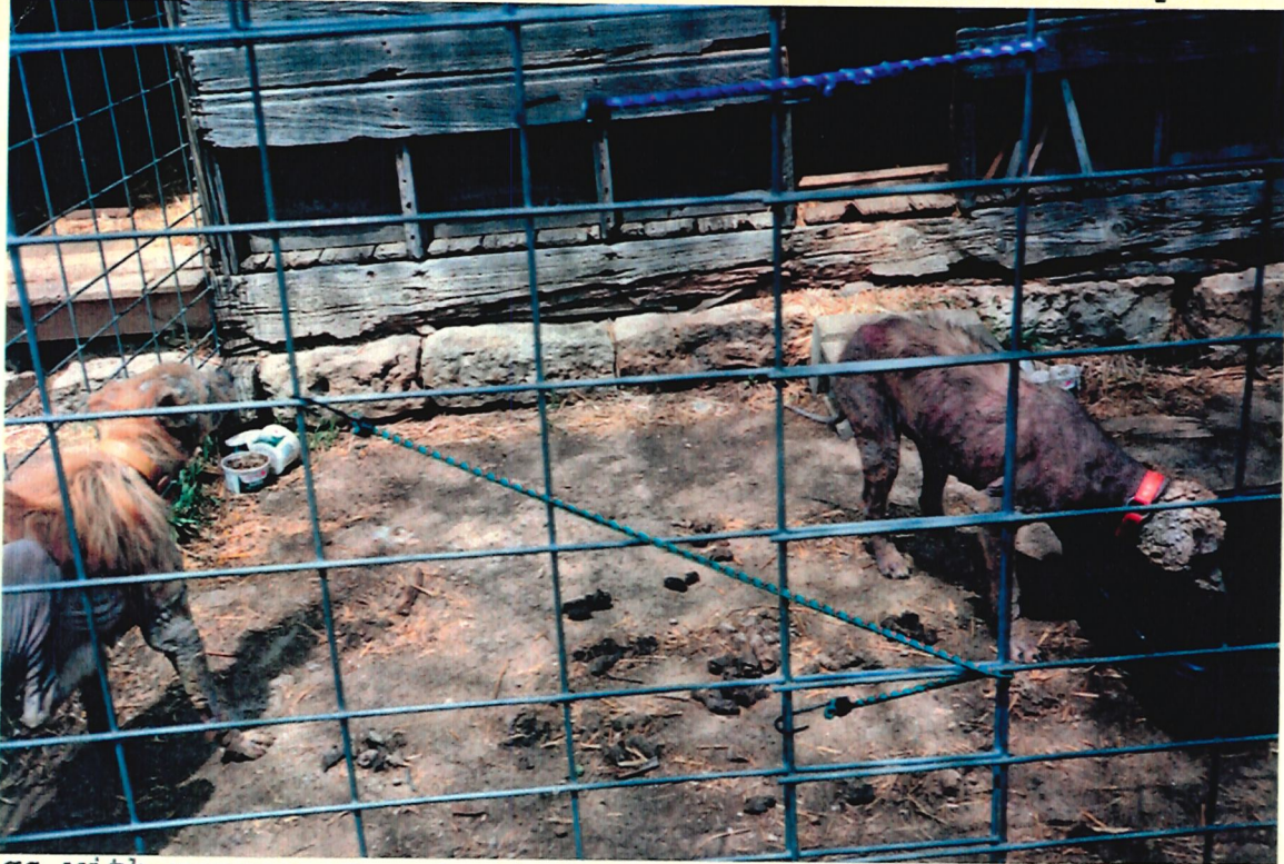
Dogs with mange. One dog had mange crust on head 3in. thick.

Caring Hearts Farm, Inc. 5-7-91 Wilsey, KS Federally Chartered Total 35 dogs - 10 destroyed, 25 adopted All dogs voluntarily surrendered to humane society.