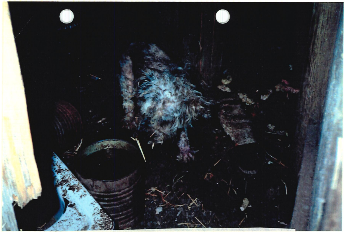
Poodle mix in pen. Mange, abscesses on back legs to bone from mats.