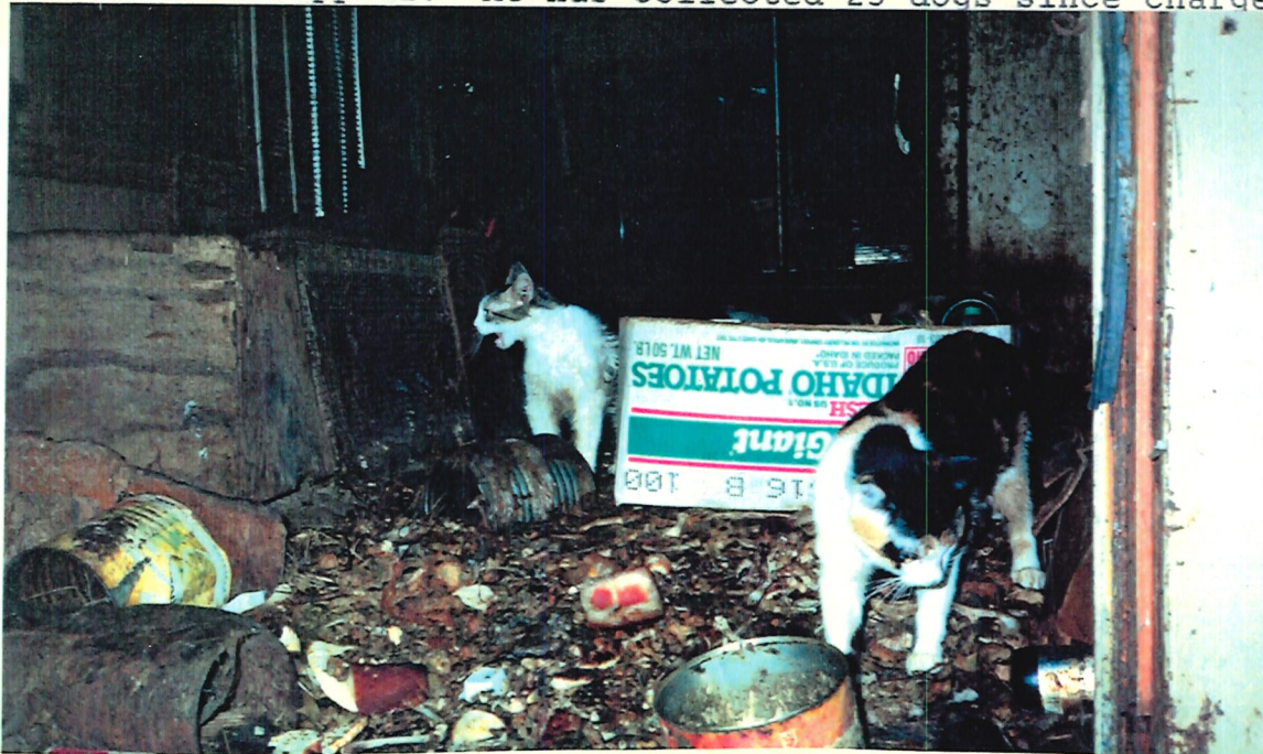
Cats housed in closed school bus - one cat with rabies. Temp. 103 degrees.

Peterson No-Kill Shelter 7-3-91 Dunlap, KS not incorporated Total 89 dogs - all destroyed due to heartworms. Case now on appeal. He has collected 25 dogs since charged.