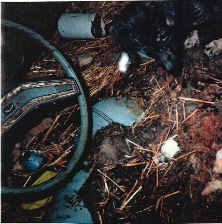
Dogs housed in closed cars. Dead dog under steering wheel. Temp. 103.