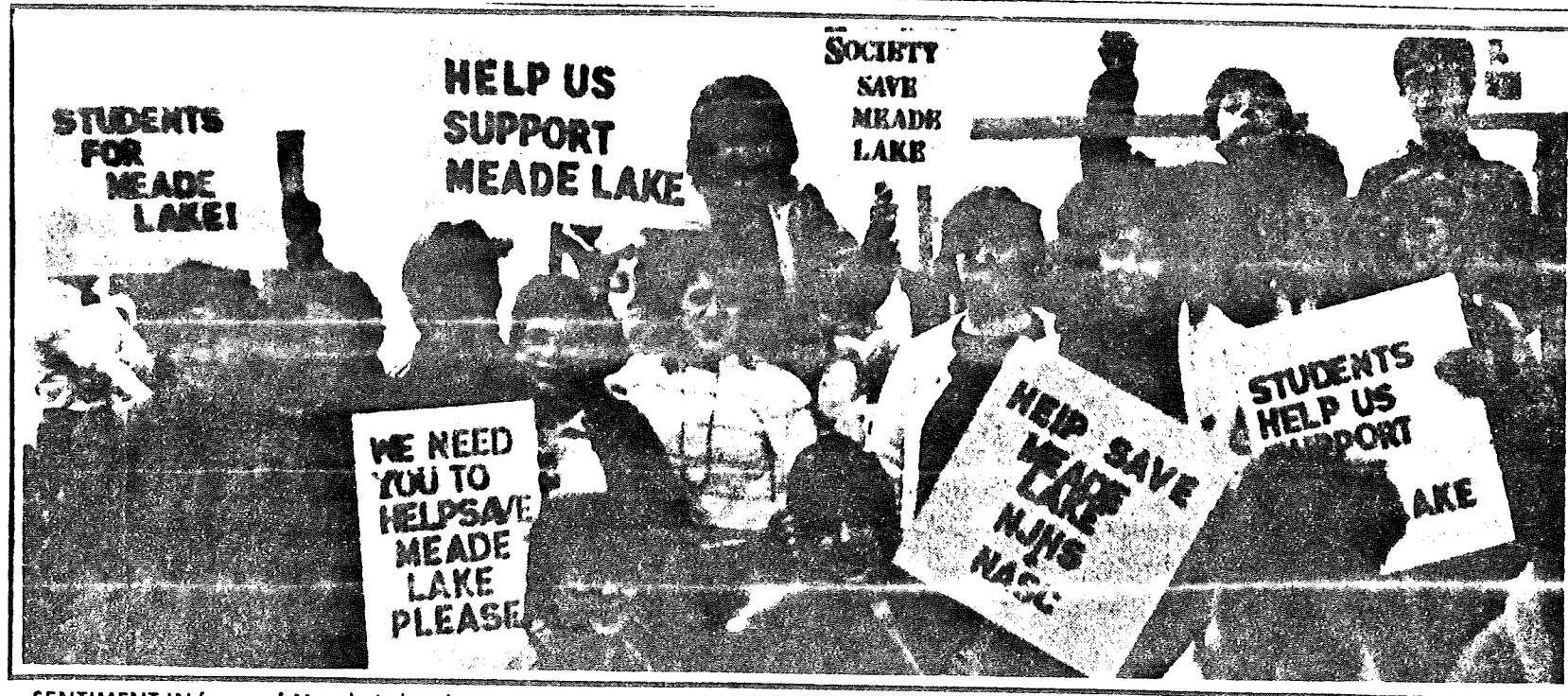
SENTIMENT IN favor of Meade Lake shows on signs held by South Junior High honor society and student council members who attended a public meeting Thursday night at the Liberal National

It was prompted by a petition drive to save the lake, which is drying up due to evaporation and water table declines.