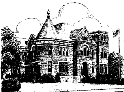
Rush County Courthouse LaCrosse, Kansas Now Listed in the National Register of Historical Places